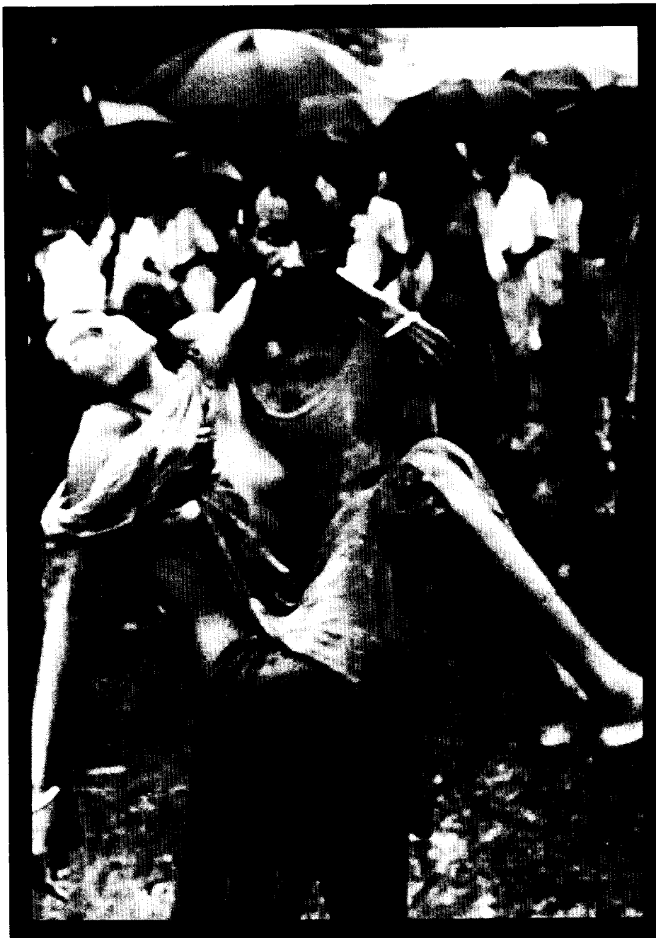
The horror of cholera in Bangladesh in the early 1970's. Can we now control and prevent it? See pages five and six.