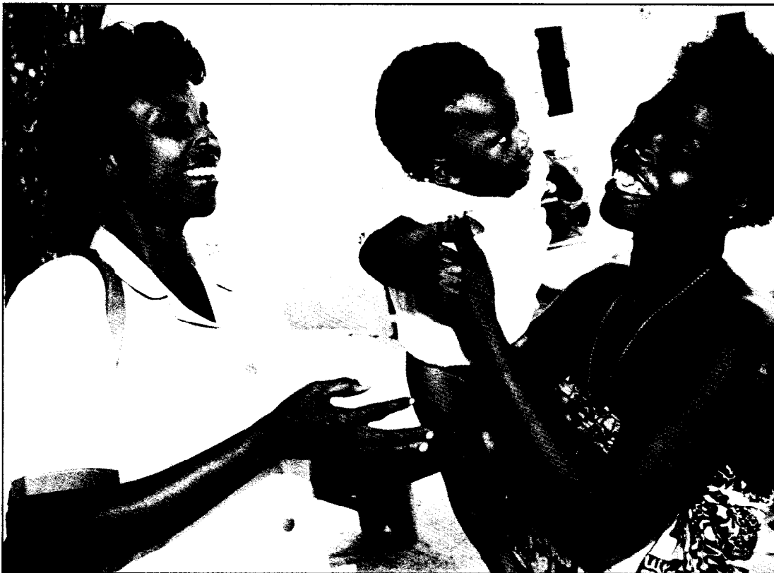
Greeting a mother and showing interest in her child's well-being are essential to effective communication.