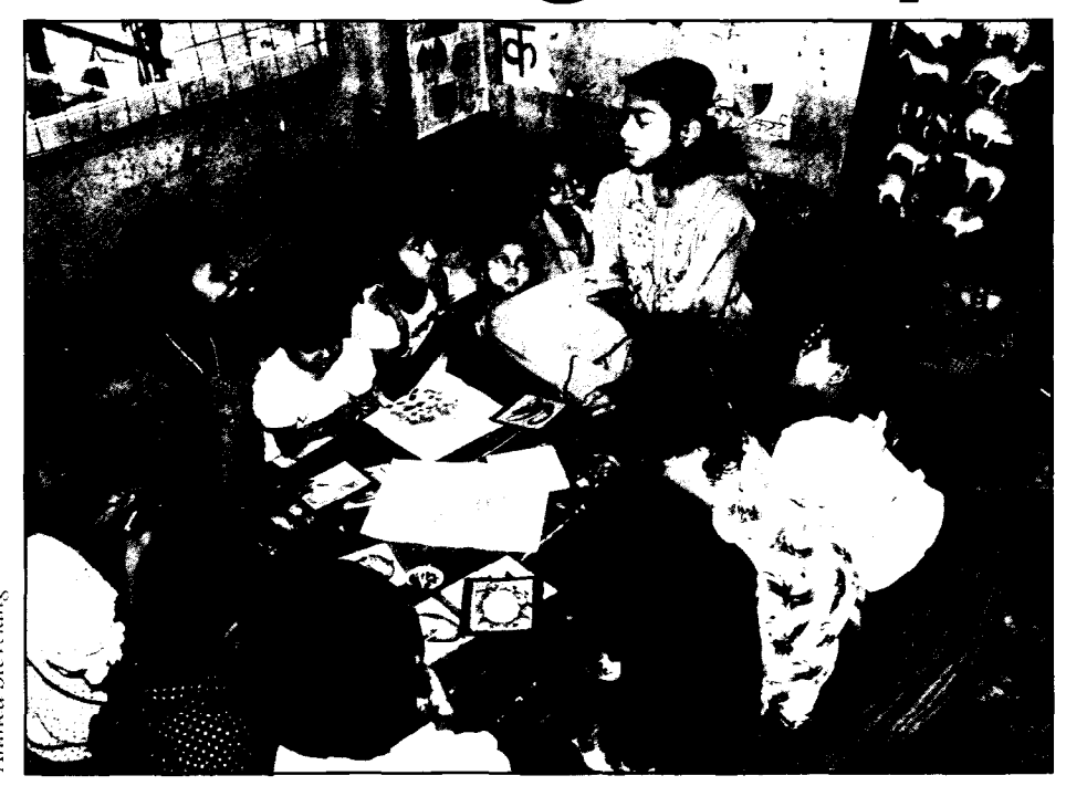
Young voices: we need to listen to children's ideas on how they can improve their health.

his issue of DD looks at a topic which is of great interest to many readers learning and teaching.