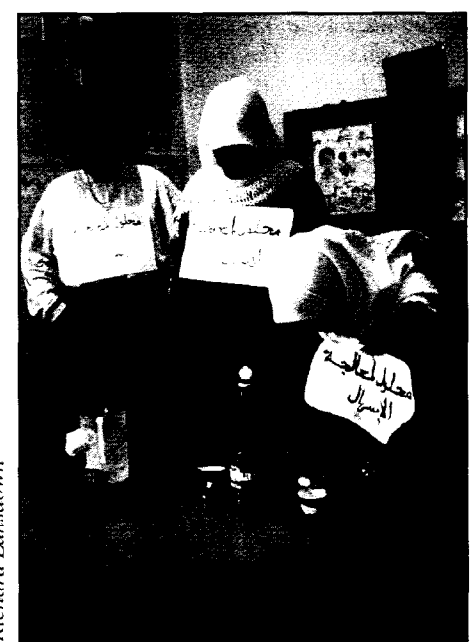
Teenagers in Lebanon show younger children how to prepare oral rehydration fluid.

To provide teachers, community workers and other adults working with children with ideas on how to put the approach into practice, the Child-to-Child Trust has produced a series of activity sheets on 35 child health topics, based on a step-by-step process.