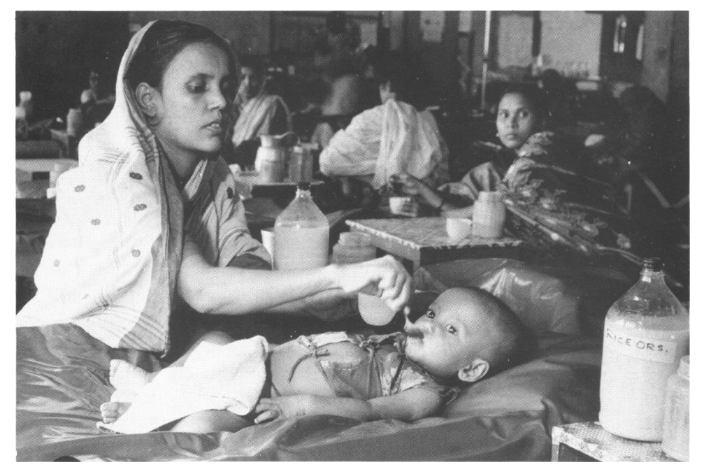
Plate 4 (b): The new rice-based oral rehydration solution being administered in Dacca.