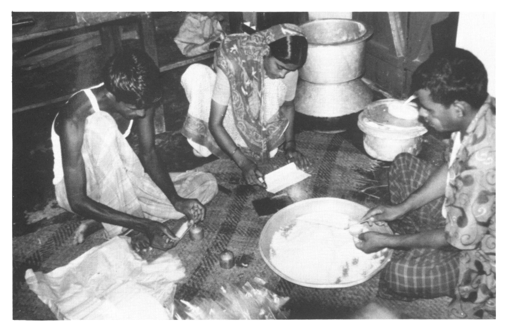
Plate 4 (a): Bengalis in Matlab mix the ingredients for oral rehydration solution and put them in small plastic packets for community distribution.