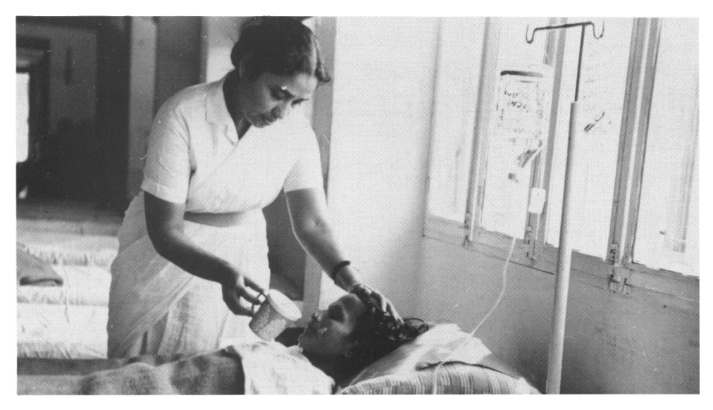
Plate 1 (b): This photograph, taken during the second protocol in Dacca, pictures the chief study nurse, Bashonti, starting oral therapy for a patient coming out of shock. Note that the IV, used for rehydration, is still connected. (Courtesy of Dr David Nalin.)

Plate 1 (a): This UPI photograph was taken at Matlab during the 1969 field trial and shows Nalin examining the pulse of a patient receiving IV rehydration to correct shock present on admission, prior to starting oral therapy (24 March 1969.) (Courtesy of the Bettmann Archive).